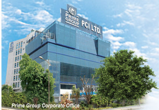
Prime Group Corporate Office